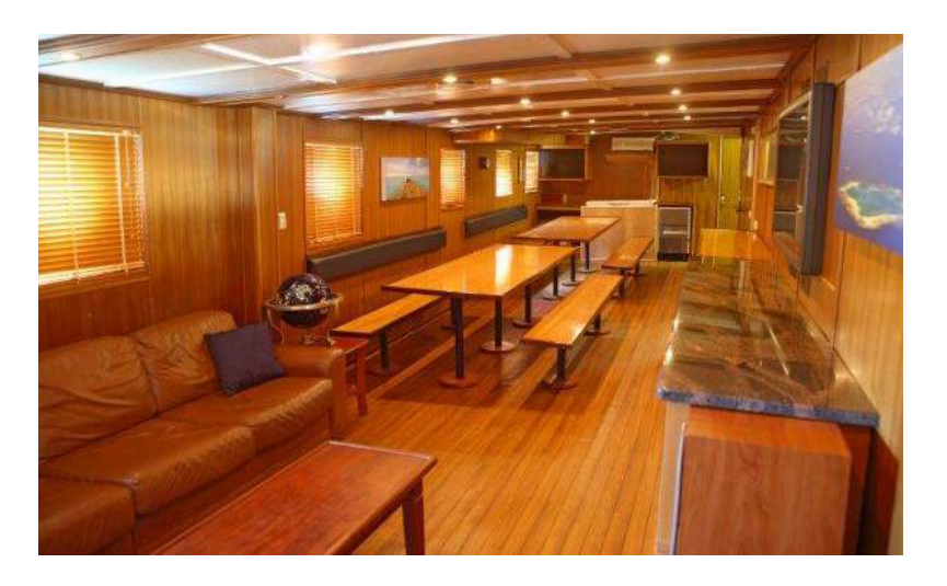
Table water and tea & coffee are served with all meals. A full range of beverages are also available onboard at extra charge. Price list available on request.