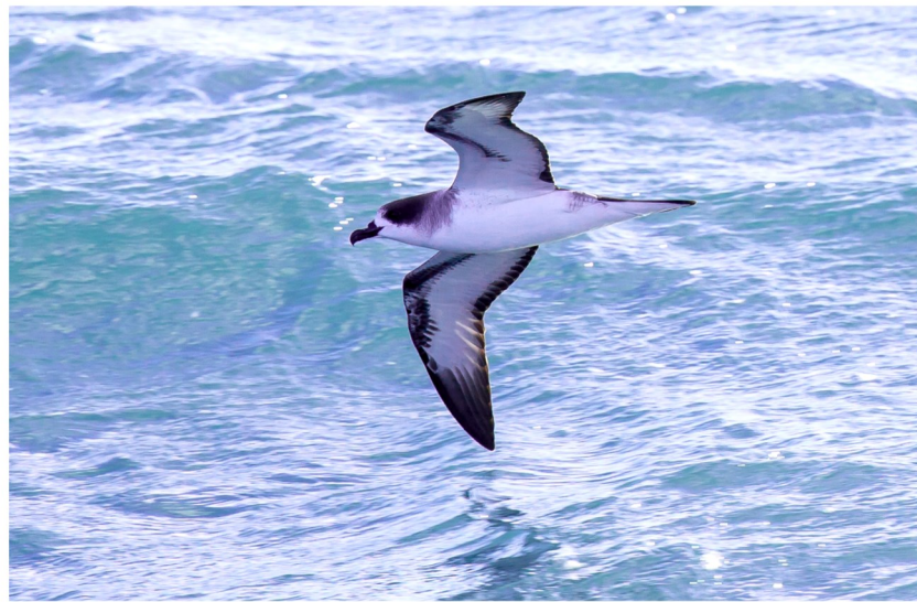
The Barau's Petrel