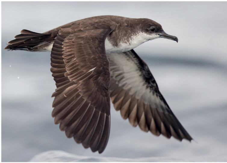
The Seychelles (Tropical) Shearwater